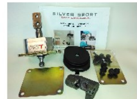
Optional front shift kit for bench seat clearance

Manual to manual and automatic to manual kits available.