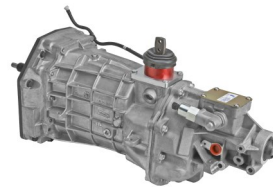
Mid Shift T56 position shown