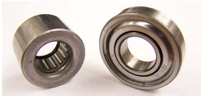
CHEVROLET PILOT BRG. PONTIAC PILOT BRG. (TRANSMISSION SIDE SHOWN)