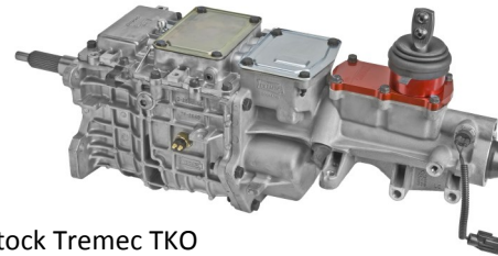
Stock Tremec TKO

Be sure to read your installation manual and follow these tips for years of fun!