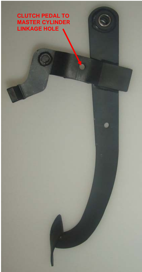
1966-70 B-Body Clutch Pedal